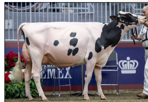
CRESTOMERE LAMBDA VORTEX VG-85-2YR, one of the many descendants of WEEBERLAC TRIUMPH VICKIE VG-88 bred in the Crestomere herd, was first Spring 2-Year-Old at Westerner Dairy Showcase in 2025 for new owners R&F Livestock Inc. (SK) and Walker Dairy Inc. (ON) after also being a class winner earlier at Alberta Dairy Congress.