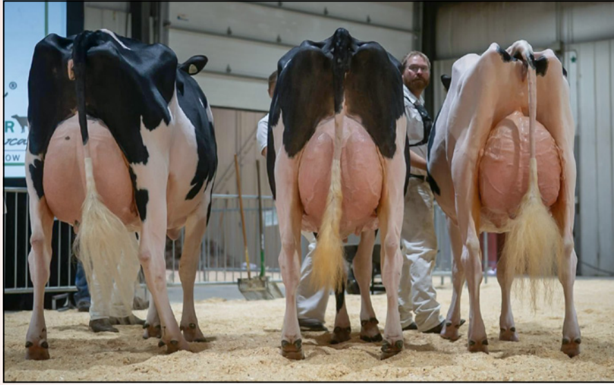
Crestomere Holsteins was Premier Breeder at Westerner Dairy Showcase in 2024 and contributing points to that award were these three cows who comprised their second prize Breeder's Herd at that show, from left: CRESTOMERE TATOO VEZ EX-95-2E, CRESTOMERE DOORMAN CALLIE EX-93-3E and CRESTOMERE CELLULAR TWINKLE VG-88.