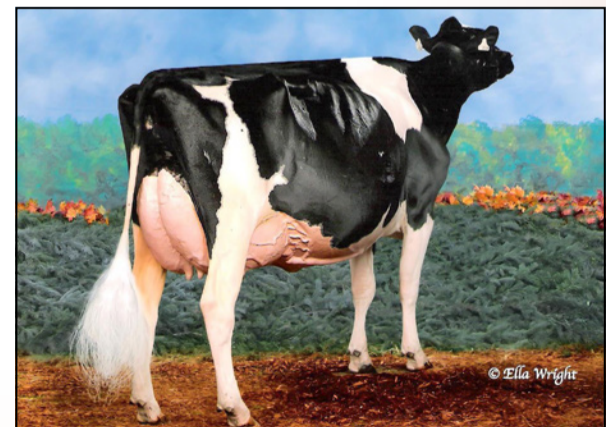
CRESTOMERE LOU VICTORIA EX-94-2E-9*, a seventh generation EX/VG in the WEEBERLAC TRIUMPH VICKIE VG-88 family, was Grand Champion at Westerner Dairy Showcase and Reserve All-Canadian Senior 3-Year-Old in 2011 for Crestomere Holsteins and is now the dam of five EX and five VG daughters.