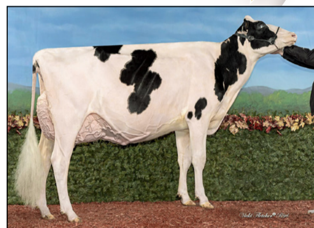
The kind Crestomere Holsteins likes to breed and sell, CRESTOMERE CELLULAR TWINKLE VG-88 completes 14 generations of VG/EX in the RAVENSWELL LYDIA EX-92-USA-DOM-19* family and was first Junior 3-Year-Old and Reserve Intermediate Champion at Westerner Dairy Showcase in 2024.