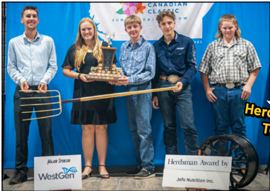
Herdsmanship Award Team Manitoba