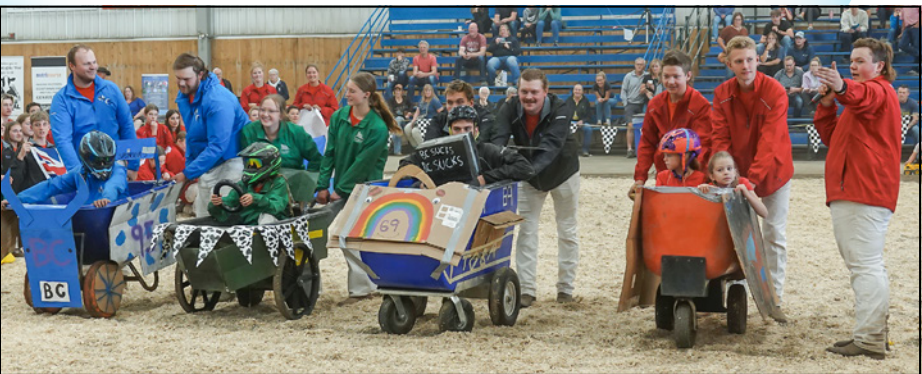
Closing ceremonies on Saturday included the highly anticipated Formoola 1 race around the ring.

The WestGen Canadian Classic has endured four decades in no small part because past participants are so deeply impacted by the experience, they return to support and lead it for another generation. But without the significant financial support of businesses across the west, it could not have thrived. Now with WestGen's epic investment of $500,000 over the next 10 years, another decade of WCC youth have certainty, allowing them to thrive, growing into industry and community leaders.