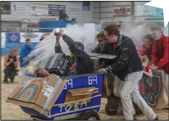
Alberta eats dust (baby powder) as Team Toba takes an early lead!