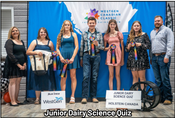
Junior Dairy Science Quiz