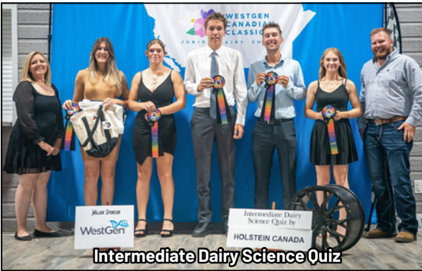
Intermediate Dairy Science Quiz