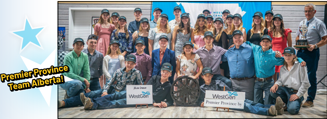
Premier Province Team Alberta!