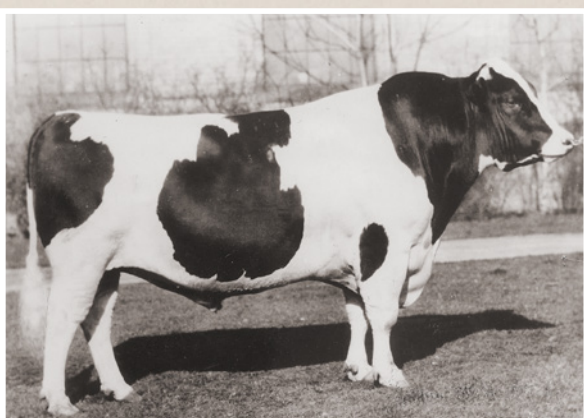
JOHANNA RAG APPLE PABST was purchased by Mount Victoria Farms in 1926 and became the cornerstone of their breeding program. This 5X All-American and 3X Royal Winter Fair Grand Champion bull is considered to be the foundation of the breed's Rag Apple bloodline.