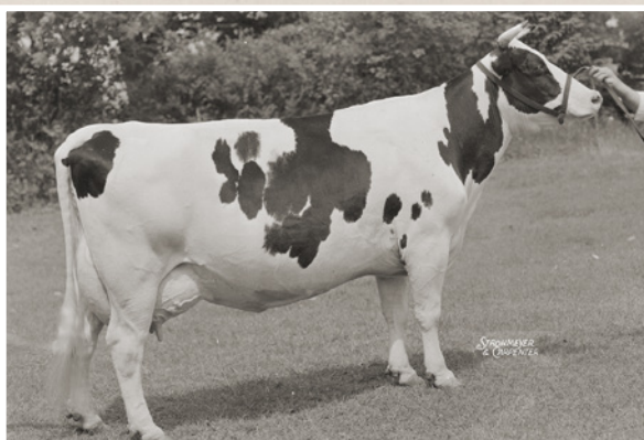
MONTVIC BONHEUR PIETJE B, All-American 4-Year-Old and a member of the All-American Get by MONTVIC PATHFINDER in 1941, she brought the top bid of $6500 in the 1942 Mount Victoria Dispersal, an event that drew over 2000 people despite gas rationing and tire shortages.

taking champion honours 3X each, and TRIUNE PAPOOSE PIEBE and OAKHURST COLANTHA ABBEKERK winning the top prize 2X. Many Canadian and World leading production records were made here as well by cows such as MONTVIC BONHEUR HARTOG and MONTVIC RAG APPLE COLANTHA ABBEKERK.