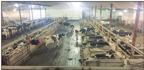
Inside the Mil-En-Roy barn, cows enjoy the benefits of bright, spacious, comfortable freestall housing and Lely robot milking.