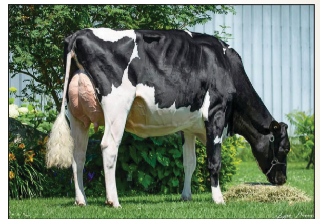
MIL-EN-ROY CHIEF KARINA EX-93, a sixth generation EX/VG in Mil-En-Roy's WENDON REIM GCHIP KAREN VG-88-3* family, is currently owned by Petitclerc Holsteins, Saint-Basile, QC., where she has been a top contender at the shows.