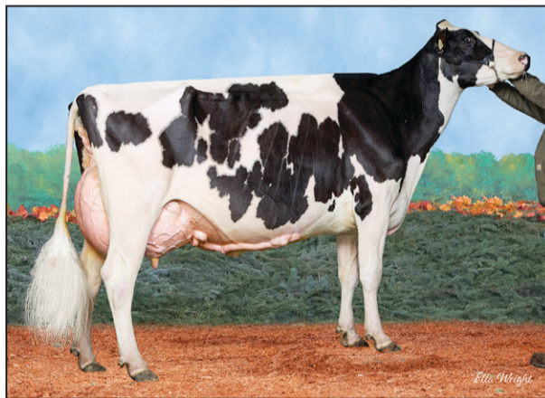
MIL-EN-ROY CHIEF GLORIETTA EX-94-2E completes eight generations of EX/VG and is a current favourite in the DONOVAN SHEIK GLORIETTA ET VG-85-11* family that contributed the bulk of the points for Mil-En-Roy Farms' second Master Breeder Shield.