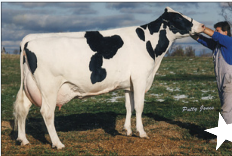
SUNNYLODGE PRELUDE SPOTTIE VG-87-18*, the most famous first-crop daughter of any bull, helped to put Sunnylodge Farms on the map through her ability to produce a long line of outstanding daughters and many sons in A.I. like SUNNYLODGE LINJET EX-ST, 2002 Premier Sire at World Dairy Expo.