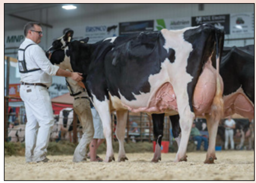
CORLANE DELTA GUMDROP EX-90 4E 1*, 1st Longtime Production Cow, Alberta Dairy Congress 2023. Gumdrop goes back to foundation cow, CORLANE INSPIRATION GERDA EX-90 5E 4*.