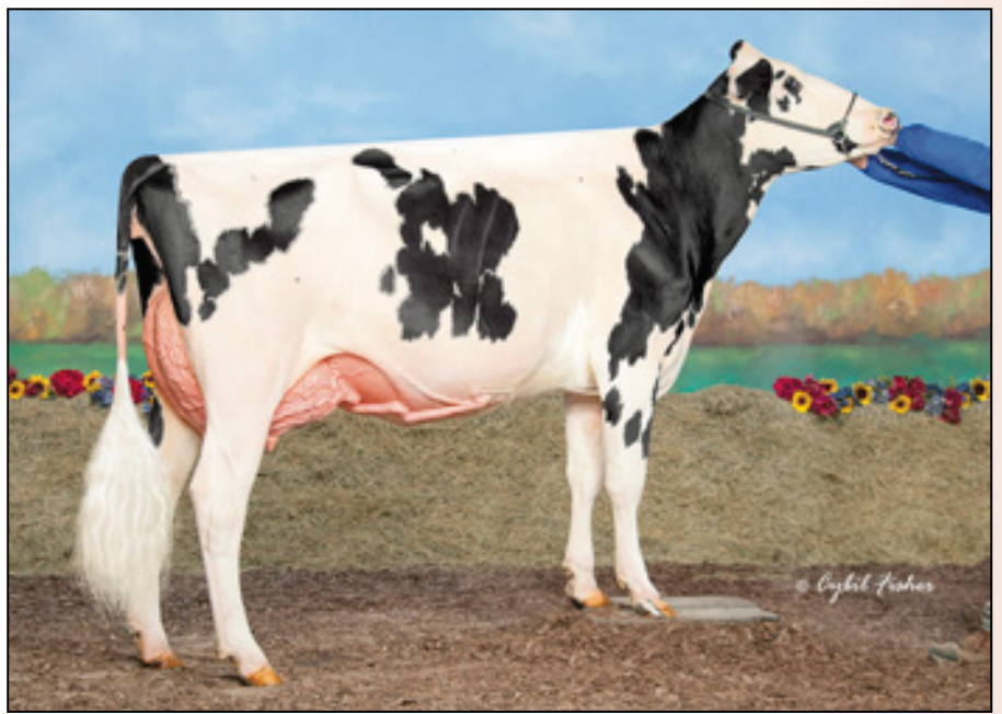
Maternal sister to Desire, CORLANE ENTRANCE DELANEY EX-92 is now owned by Elmvue Farms, NY. She was Honourable Mention All-American Senior 2-Year Old in 2020, and Intermediate Champion at the Northeast All-Breeds Fall Holstein Show.