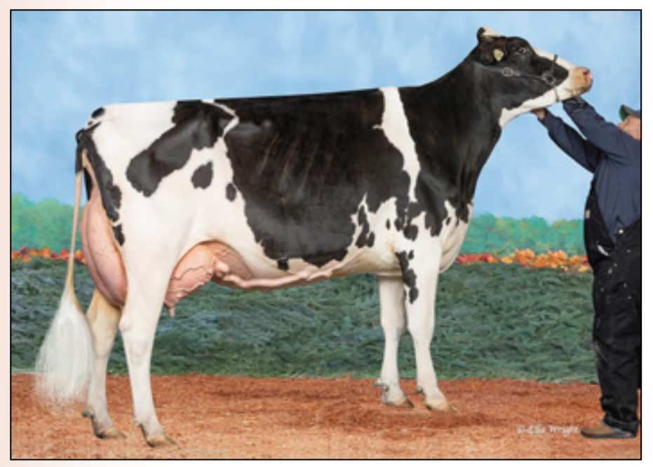
A sixth generation descendant of Gerda, CORLANE MIDNIGHT DESIRE EX-92, has two daughters milking in the Corlane herd, and a promising Delta Lambda daughter due in the fall.