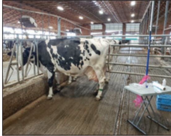
An 'outlier' with no heifers, 59 was flushed a number of times to ensure her genes would continue in the herd.