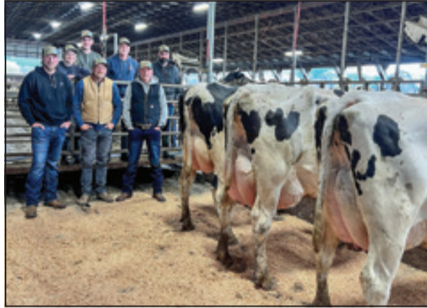
The Huizing Family has high hopes for these daughters of '59'. (L-R) BUNDLE 1027 - GP83, DELTA 9093 - GP80, DELTA 31 - VG85.